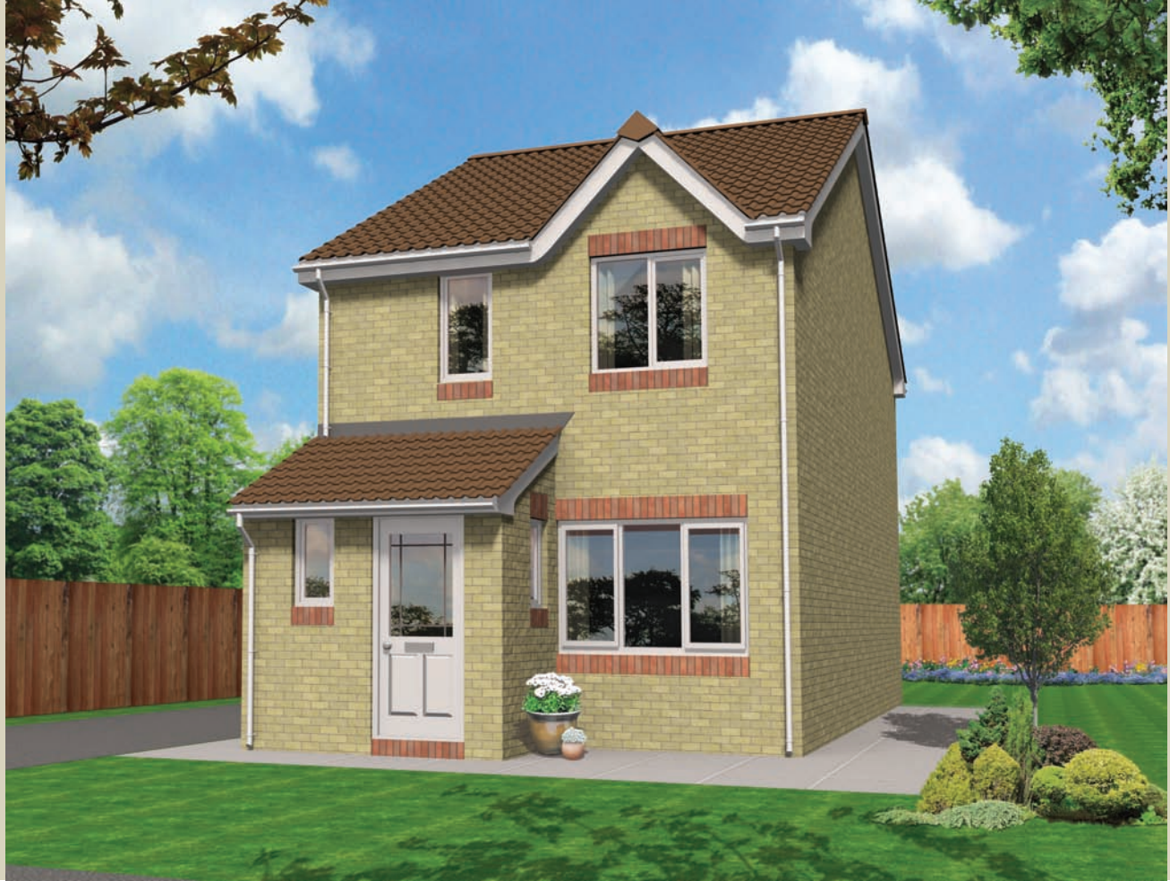
Jasmine - 3 bed detached